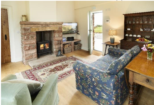
Entrance door into the Living area