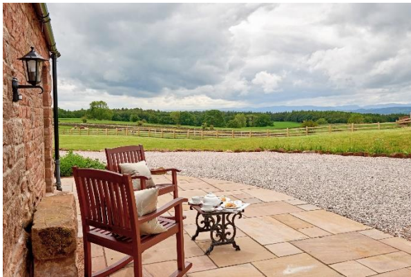
Parking and entrance at Vale Croft