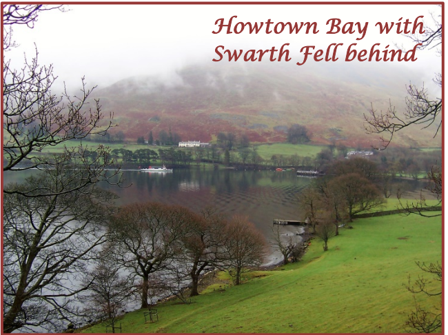
Howtown Bay with Swarth Fell behind