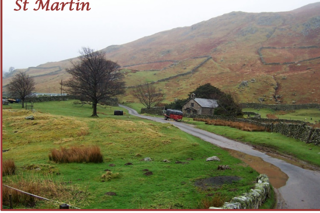
Martindale and old church of St Martin