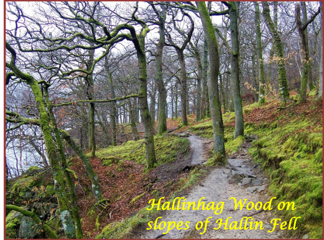
Hallinbeg Wood on slopes of Hallin Fell