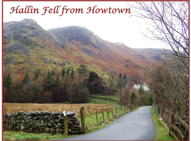
Hallin Fell from Howtown