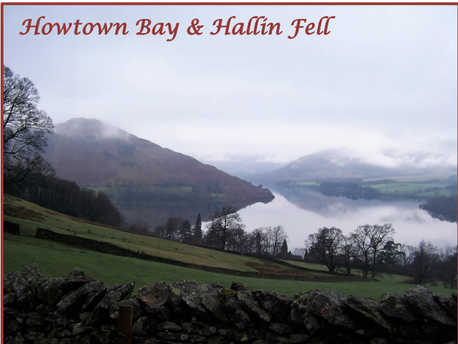
Howtown Bay & Hallin Fell