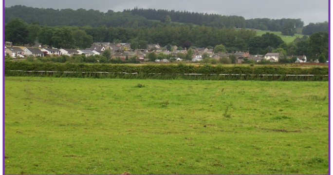
Greystoke, with Greystoke Park behind