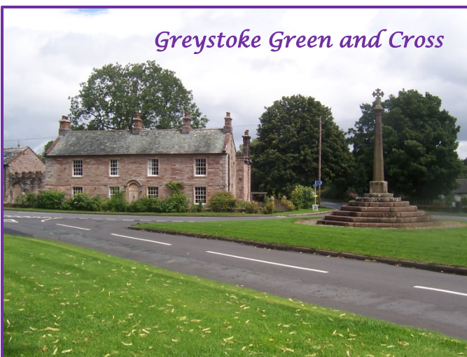
Greystoke Green and Cross