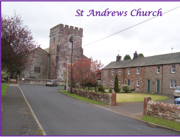
St Andrews Church