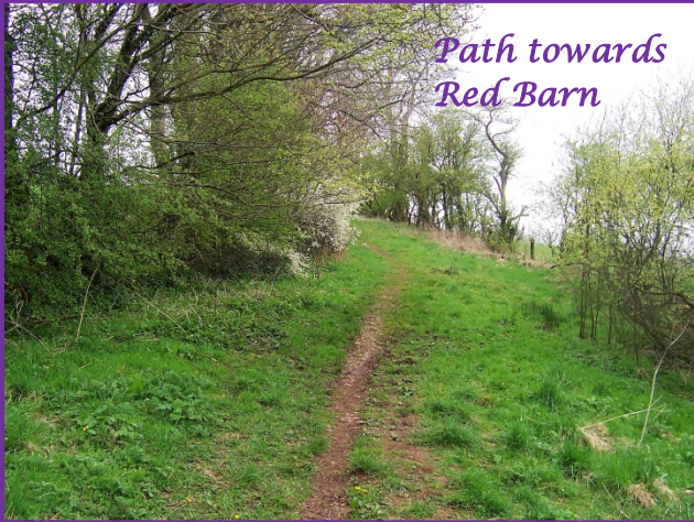
Path towards Red Barn