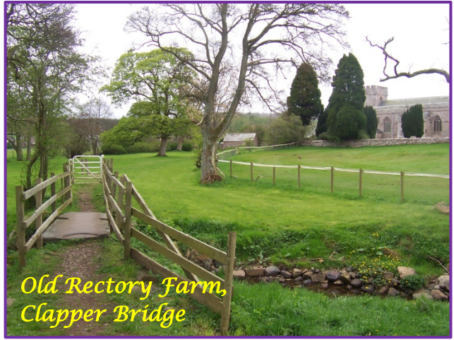
Old Rectory Farm, Clapper Bridge