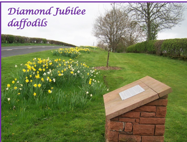
Diamond Jubilee daffodils