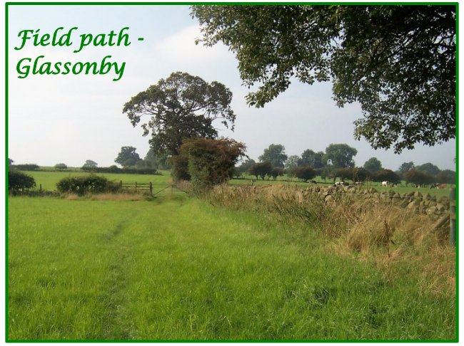
Field path - Glassonby