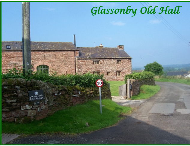
Glassonby Old Hall