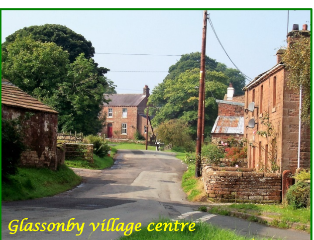
Glassonby village centre