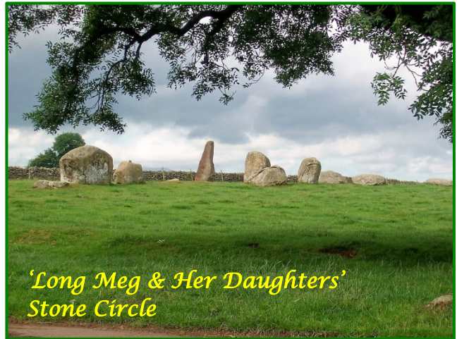
'Long Meg & Her Daughters' Stone Circle