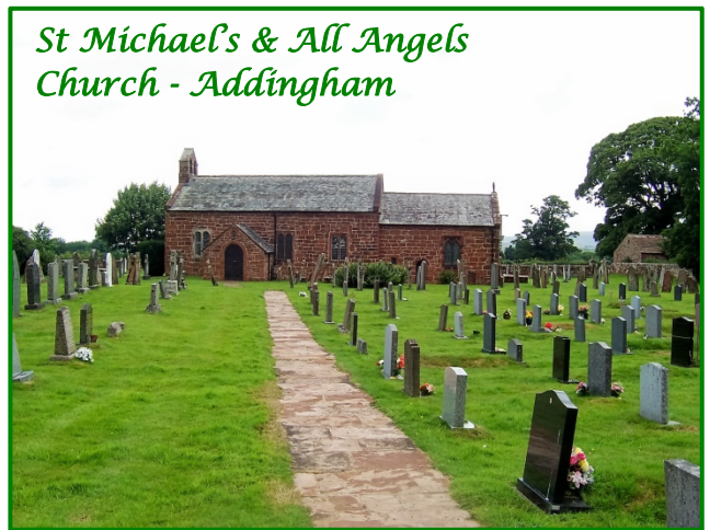
St Michael's & All Angels Church - Addingham